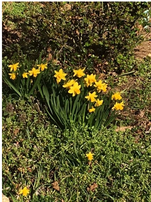
Daffodils in February? Whaaat?